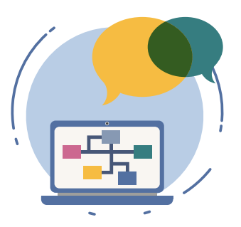
Practical notes for implementing the INCB guidelines for a voluntary code of practice for the chemical industry, and a model MoU