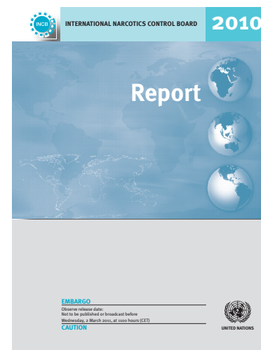
Cover page of the Report of the International Narcotics Control Board