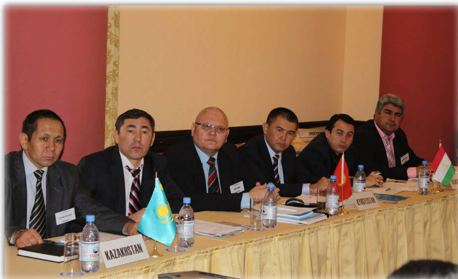
Regional workshop on regulatory mechanisms for precursor control, held in Almaty, Kazakhstan, in October 2011

The representatives of the Central Asian countries and CARICC provided an overview of the current drug and precursor-related situation in Central Asia. The representative of CEFIC shared experiences and practical implications for the chemical industry with regard to precursor control in the European Union, based on legal obligations and voluntary cooperation with competent national authorities.