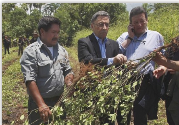
High-level INCB mission and Vice-Minister for Social Defense and Controlled Substances (left) observe a coca eradication exercise in Chaparé

Police Force) and observed a coca bush eradication exercise in Chaparé.