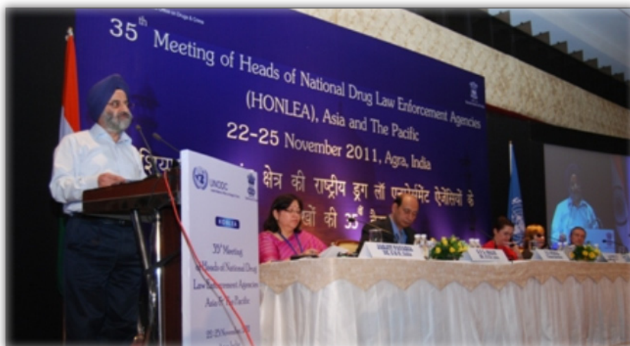
35th Meeting of Heads of National Drug Law Enforcement Agencies, held in Agra, India, in November 2011